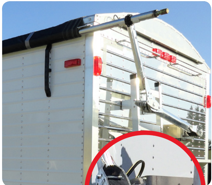
Heavy Duty Adjustable Mounting Bracket